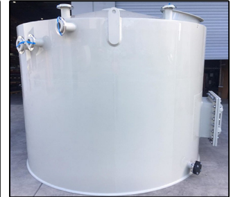
PP STORAGE TANK