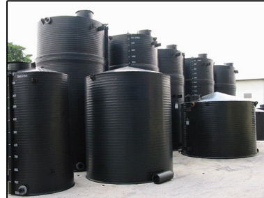
HDPE SPIRAL TANK